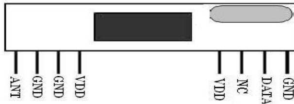
Figure1 CY02 Shape & Pins